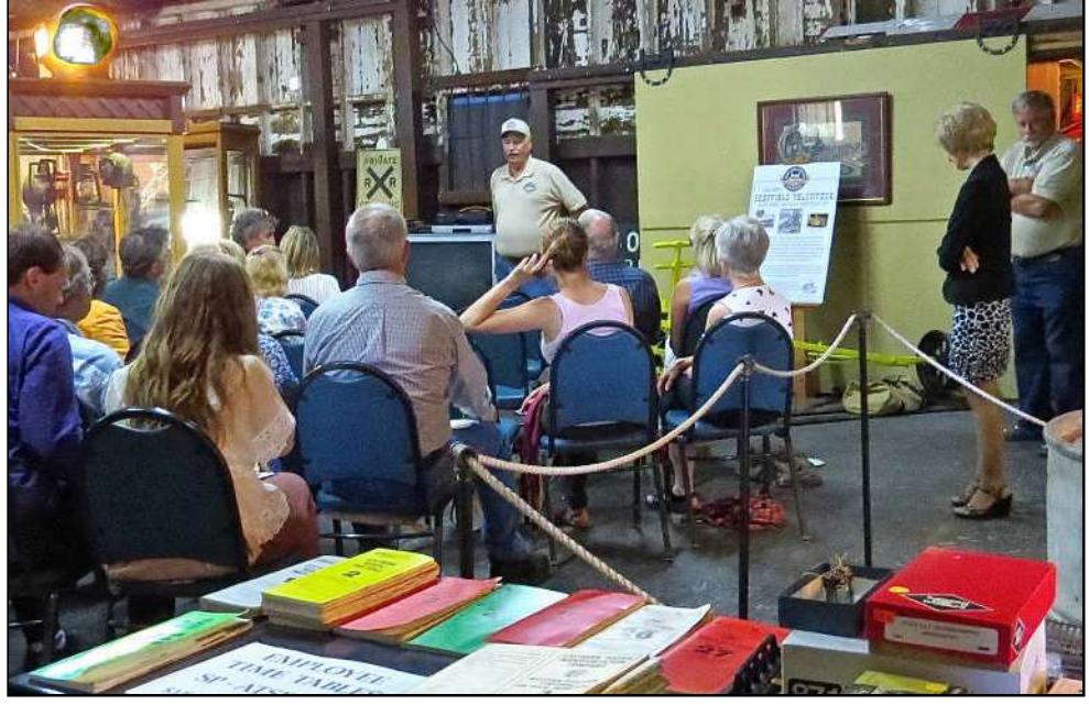
On the evening of July 28th, about 30 members of organizations involved in promoting and serving visitors to the area met at the Freighthouse for informal presentations, and snacks and beverages provided by local vendors. Local government agencies and advisory bodies, Amtrak, the History Center, the Chamber of Commerce, and the County Library were among those represented. Museum volunteers outlined the many aspects of the Museum's operations, including preserving and restoring artifacts, informing visitors of all ages, and providing material for researchers.