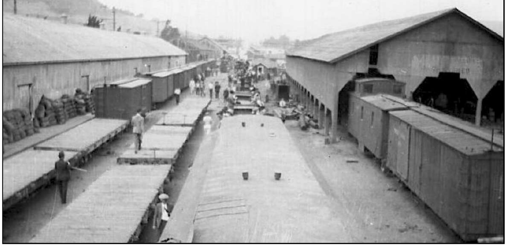
This photo shows part of the Pacific Coast Railway's San Luis Obispo shops at its maximum extent, before the 1892 fire. The coach shed is on the right, with its side wall sheathing beginning several feet above the ground.

In the last few years commentators have had much to say about economic disparity and political polarization at the national level. As students of historical campaigns and journalism know, suspicion and sewing discord are nothing new. But a copy of a letter in the Museum's archives reveals a surprising local angle from 1892.