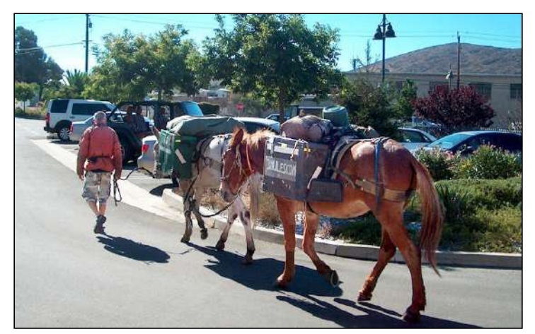
In October 2014 a train of a different kind passed by, a pack train.

And the good news is that the approved neighboring development will be required to pave and install sidewalks along Emily Street south to its intersection with Roundhouse Avenue, while having little or no impact on the remaining part of Emily Street that the Museum occupies. Museum volunteers had followed the proposal through several versions and meetings during the public hearing process. Hopefully the end result will be a more attractive and safer southern approach to Emily Street Yard. There remains the long-term concern of finding a supplemental or replacement site for Emily Street, especially one where major restoration work can be done sheltered from weather. That issue is among many addressed in the Museum's newly approved Strategic Plan .