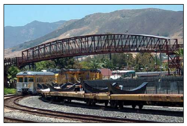
The young visitors got to see the midday Amtrak Surfliner arrive and depart, with much waving. And a special treat: two spotless Union Pacific locomotives with a business-observation car on a northbound inspection trip.

Everybody Loves Kids, a road-rally group that raises funds for charities benefitting children, visited the Freighthouse on May 18. Members came to the Central Coast from as far as Oklahoma, Florida, and Maine, and the Museum was one of their stops. They tried their hand at preparing trees for the Museum's model railroad scenery, viewed the model railroad and La Cuesta, and got a very brief history of railroading in the area.