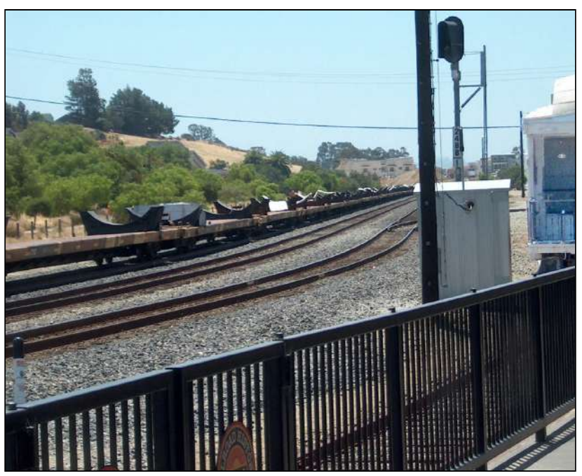
There were many things to talk about, including these long flatcars linked in sets of three and used to carry wind turbine blades, stored empty in the yard track and extending over a mile. Continued on page 3